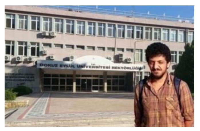
Development Party (AKP).