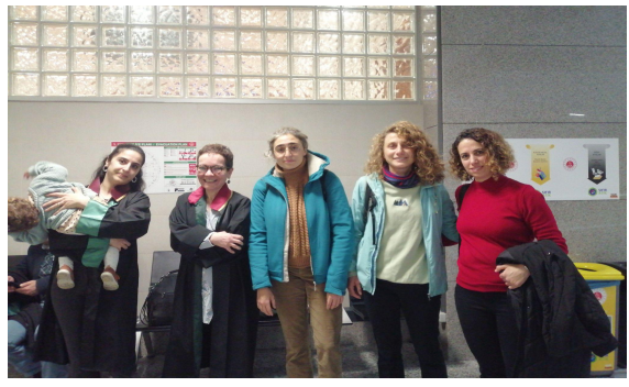
Criminal Court of First Instance.