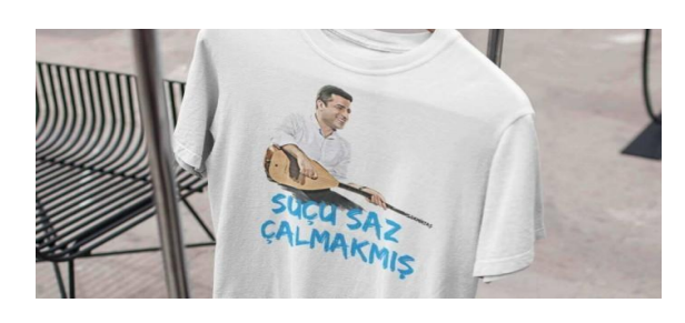
and they were also detained.

was no decree regarding Kaftancıoğlu that specified a political ban, she was prevented from doing politics during the finalized sentence. In this context, Kaftancıoğlu's political party membership was revoked by the Court of Cassation's Chief Public Prosecutor's Office.