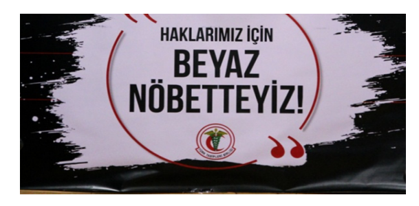
7-12-24 and February 4.

The website of Etkin News Agency (ETHA) has been banned from access with a decree of the Diyarbakır 3rd Criminal Court of Peace. The websites of the agency, which was blocked for the fifth time in the first two months of 2022, were previously censored on January