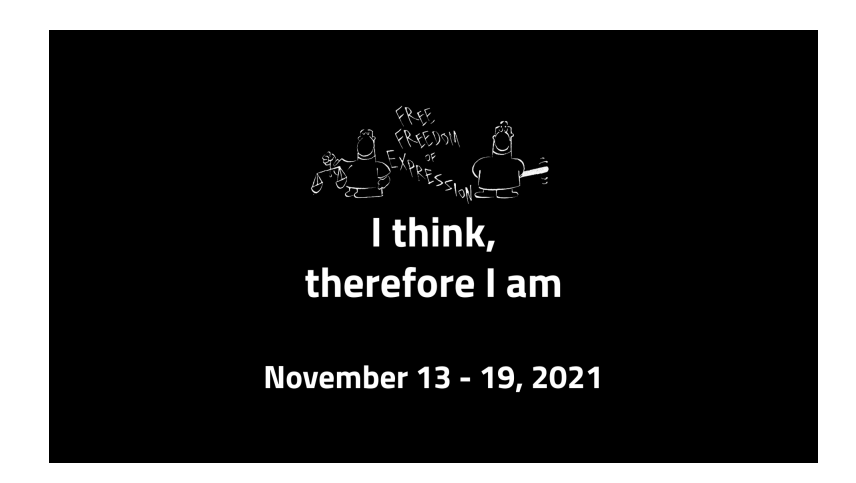
freedom of expression and thought agenda, is on our <u>YouTube channel</u> every Friday...

Our weekly video program, "COGITO ERGO SUM," in which we track Turkey's