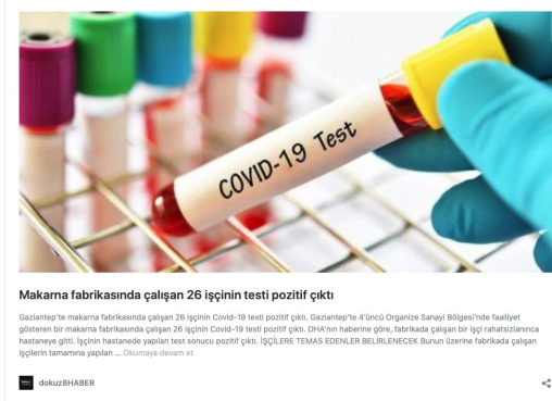
Makarna fabrikasında çalışan 26 işçinin testi pozitif çıktı

According to the data shared by Kaos GL Association, 212 discriminatory statements as well as news and articles involving hate speech against the LGBTI + were identified in national and local newspapers throughout May. In other words, content were published with discriminatory statements against the LGBTI+ about seven times a day. Please click here for details.